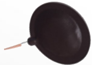
External Heel Switch