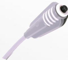
External Hand Switch

The remote switch allows either the patient or therapist the ability to trigger a muscle contraction manually.