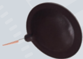
External Heel Switch