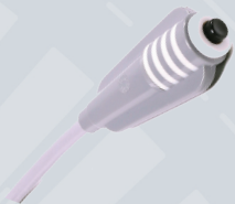
External Hand Switch